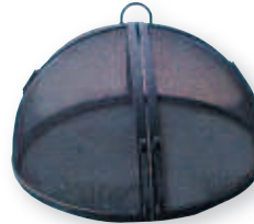
Hinged Fire Pit Screen Round