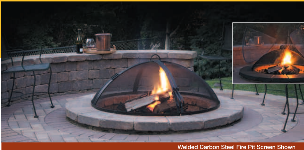
Welded Carbon Steel Fire Pit Screen Shown

Exclusive from Aspen Industries, the Master Flame brand Fire Pit Safety Screen is available for either square or round fire pits. It keeps hazardous embers from sparking and scattering around the gathering area, yet allows the warmth and lively glow of the fire to come through. The hinged design allows access for simple fire management.