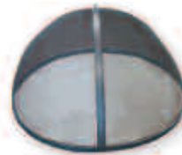
Dome-Shaped Fire Pit Screen (No Hinge)