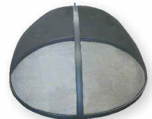
Dome-Shaped Fire Pit Screen (No Hinge)