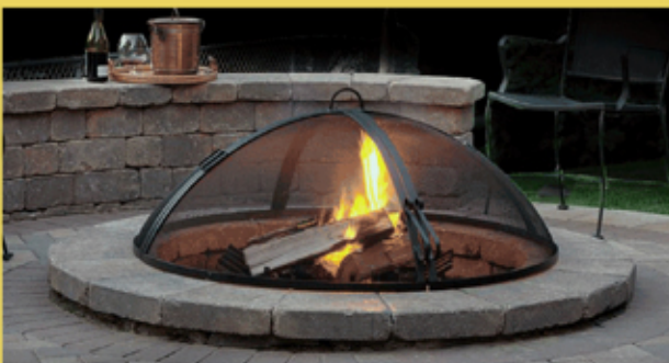
Round - Hinged